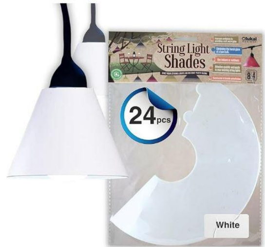
Amazon – 6107500 One Light Dimmable LED outdoor